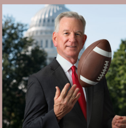
TOMMY TUBERVILLE United States Senator - Alabama

Elected in 2020, Senator Tommy Tuberville — better known to most people as “Coach” — is currently serving his first term representing Alabama in the United States Senate. A former college football coach, Senator Tuberville is a proven winner and leader, with a unique ability to bring people together. Coach's top priorities include strengthening the U.S. military, supporting Alabama's farmers, standing up for our nation's veterans, and promoting pro-growth economic policies.