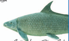
Eastern Blue Sucker